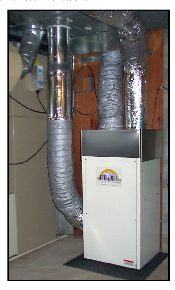
A whole house ducted dehumidifier delivers the ultimate in comfort and healthy indoor air

Consider Investing In A High Capacity Ducted Dehumidifier: Even the best air conditioner can't keep the house dry and comfortable during cloudy or rainy weather. There are now high efficiency, high capacity dehumidifiers available that supplement the air conditioning system, delivering the ultimate in indoor comfort and indoor air quality. They can be installed out of sight using ductwork, and connected to a condensate drain so that you never have to empty the reservoir. This equipment dehumidifies the whole house and also cleans the air 24 hours a day, 365 days a year. Some models even provide filtered fresh outdoor ventilation air. Ask your contractor for recommendations.