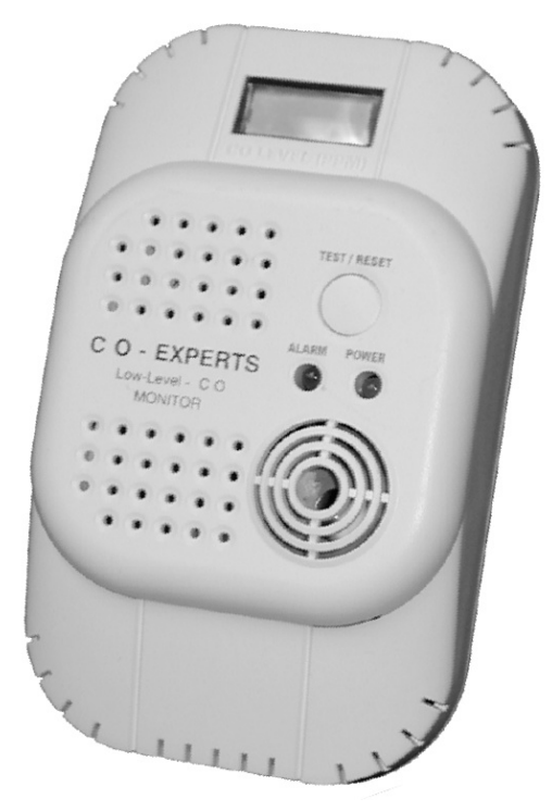
Have your CO Alarm tested, and look into an alarm that monitors chronic lower levels of Carbon Monoxide

levels in your home that can cause permanent neurological damage. Low levels of CO are especially hazardous for infants, unborn babies, the elderly and those with chronic illnesses. Ask your contractor for information on a new Low Level Health Monitor device which will give you early warning.