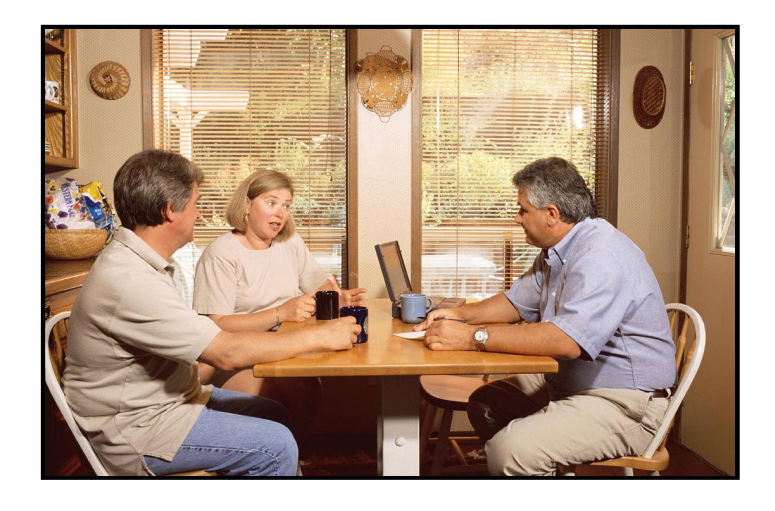
The most important step to buying a new heating and cooling system is to pick the right contractor

© Comfort Institute Inc. 2002-2003 All Rights Reserved, Document C-SRT-110 Version 1.1, For distribution only by Comfort Institute Members in good standing. Reproduction and distribution by non members strictly forbidden